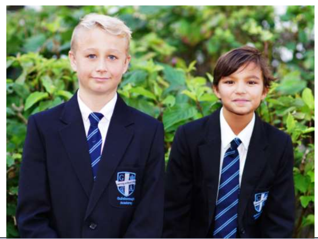
GUILSBOROUGH ACADEMY MAIN UNIFORM LIST Uniform for Key Stage 3 & 4 students (Years 7 – 11)

The staff and Governors expect all students to wear the Guilsborough Academy uniform throughout Years 7 to 11 so that their appearance is smart and tidy, both within and outside the school. If parents/carers are on a low income and in receipt of support, they should contact the Academy as help may be available with the cost of the essential items of uniform. By accepting a place at Guilsborough Academy, parents are committing the student to wear the agreed uniform.