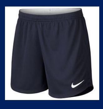
NIKE Academy Shorts Ladies £12.00