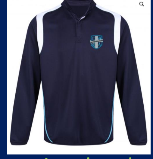
Long sleeved reversible rugby top