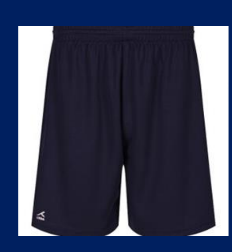
Plain navy shorts