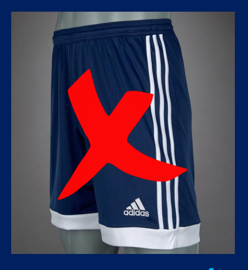
NO stripes/ patterns or large logos. NO other colour except navy