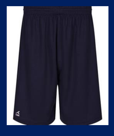
Plain navy shorts