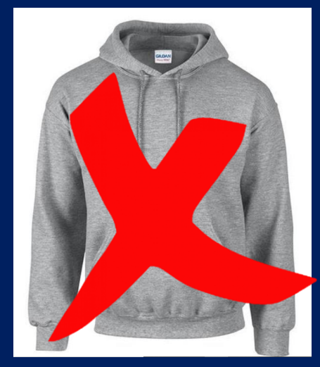
NO Hoodies or jumpers of any colour!

Exception is a BLUE tour hoodie with the school logo No leavers hoodie!!