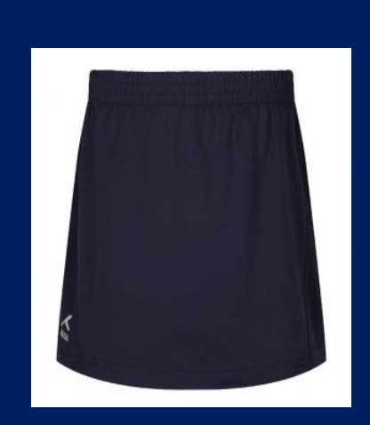
Plain navy skort