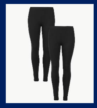
2 Pack High Waisted Leggings -£15.00