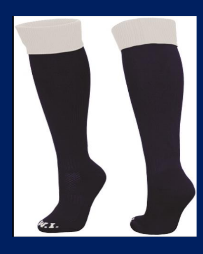
Plain navy socks *