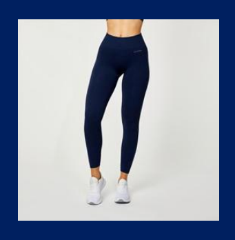
USA PRO High Rise Seamless Leggings £9.00