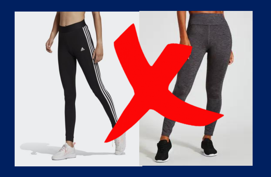
NO stripes/ patterns or large logos. NO other colour except navy

Exception is a BLUE tour hoodie with the school logo No leavers hoodie!!