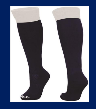
Plain navy socks *