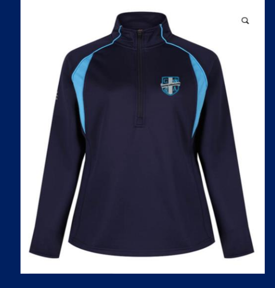
Long sleeved ¾ zip top