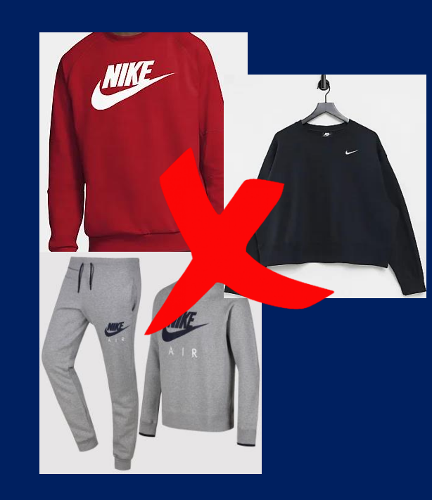
NO branded kit.