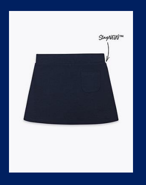
Girls' Cotton with Stretch Sports School Skorts (2-16 Yrs) £6.00 -£9.00