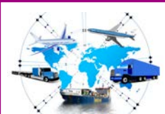
Manufacturing, Processing & Logistics