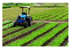
Agriculture, Environmental & Animal Care