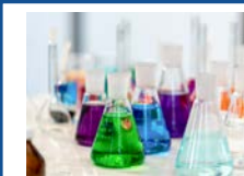
Science, Research & Development