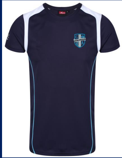
Sports Crew Neck

Compulsory items to be purchased from Tailor Made or Trutex Direct.