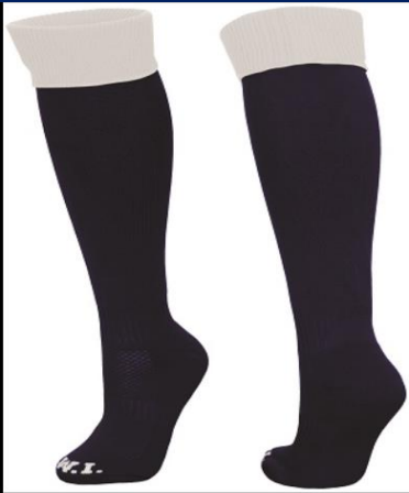
Plain navy socks *