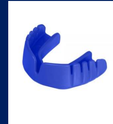
Shin pads Gum guard