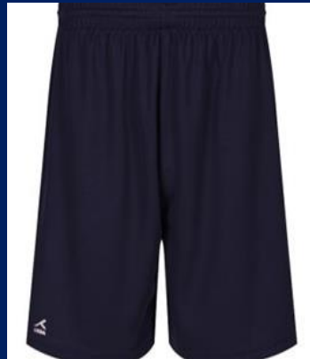
Plain navy shorts