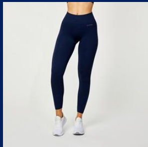
USA PRO High Rise Seamless Leggings £9.00