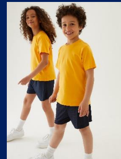
Unisex Sports School Shorts (2-16 Yrs) - £7.00