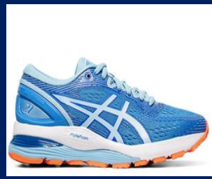
Trainers Football boots