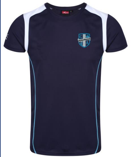
Sports Crew neck

Compulsory items to be purchased from Tailor Made or Trutex Direct.