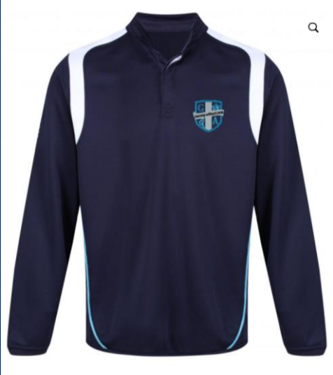
Long sleeved top