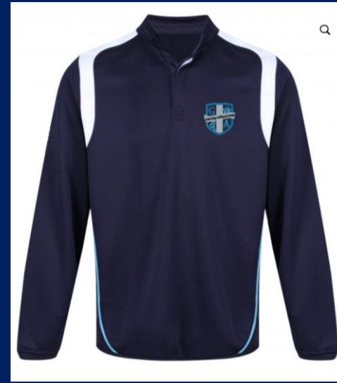
Long sleeved top