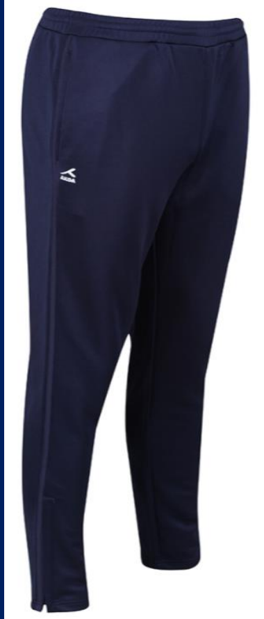
Plain Navy track pants