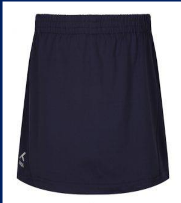
Plain navy skirt

Compulsory items to be purchased from anywhere.