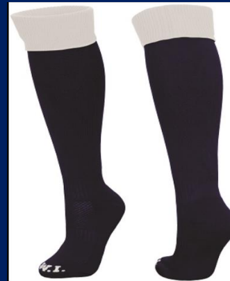
Plain navy socks *