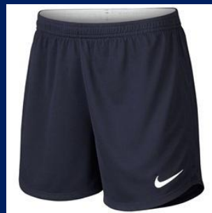
NIKE Academy Shorts Ladies £12.00