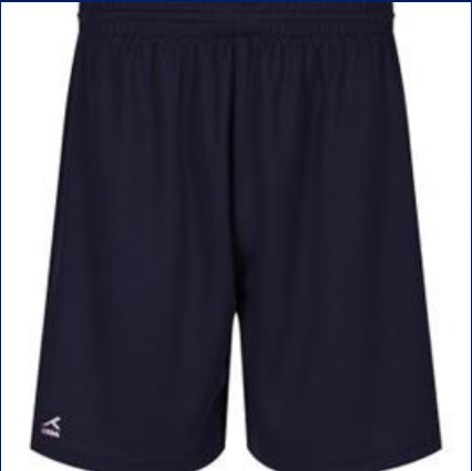
Plain navy shorts

Compulsory items to be purchased from anywhere.