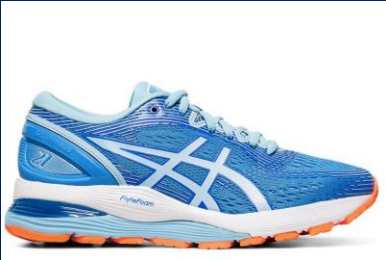
Trainers Football boots