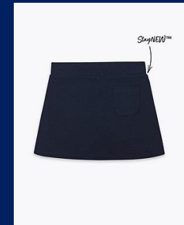
Girls' Cotton with Stretch Sports School Skorts (2-16 Yrs) £6.00 - £9.00